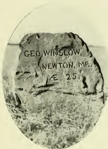
ORIGINAL MARKER AT WINSLOW GRAVE