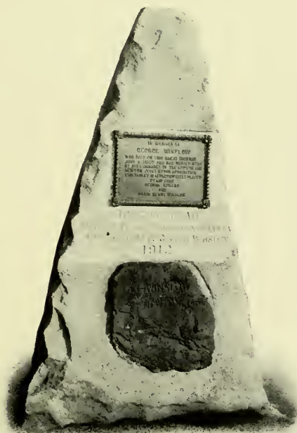
PRESENT MONUMENT AT WINSLOW GRAVE Unveiled October 29, 1912