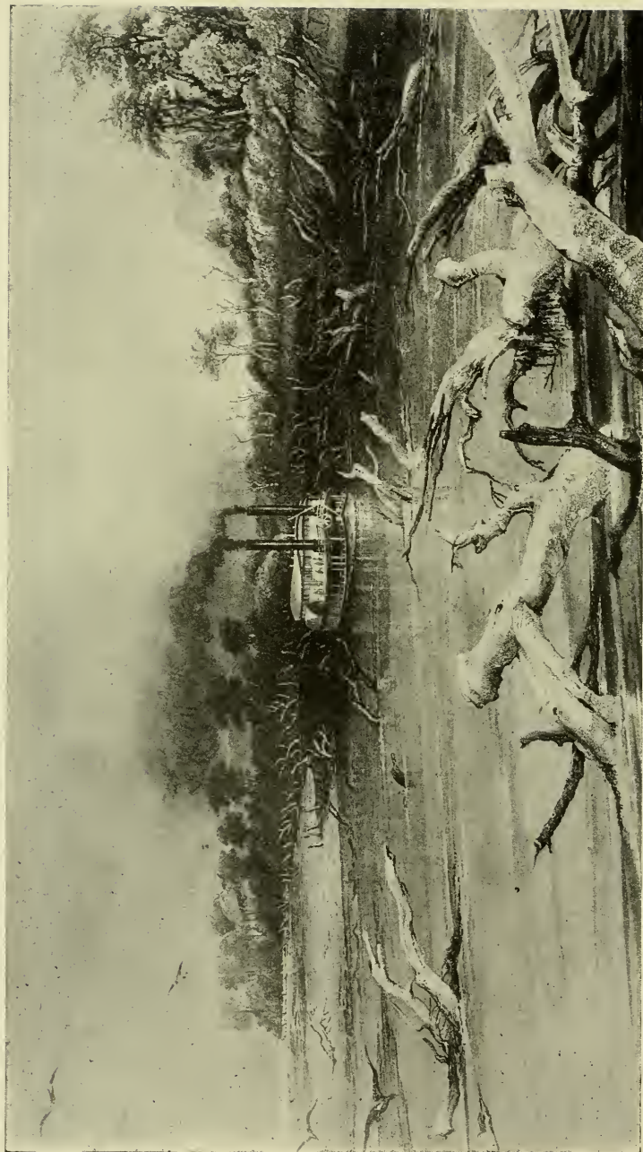
SNAGS (SUNKEN TREES) ON THE MISSOURI—From Portfolio of Maximilian Prince of Wied