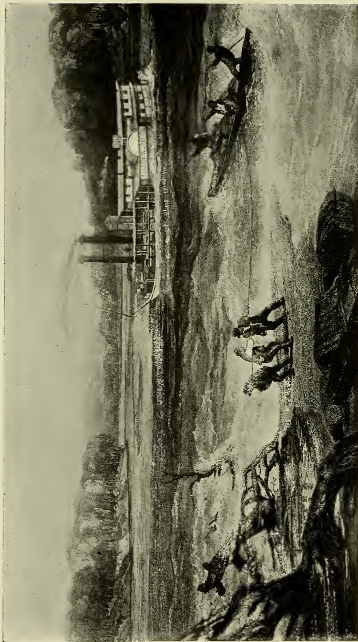
THE STEAMER YELLOWSTONE, ON APRIL 19, 1833.—From Portfolio of Maximilian Prince of Wied.